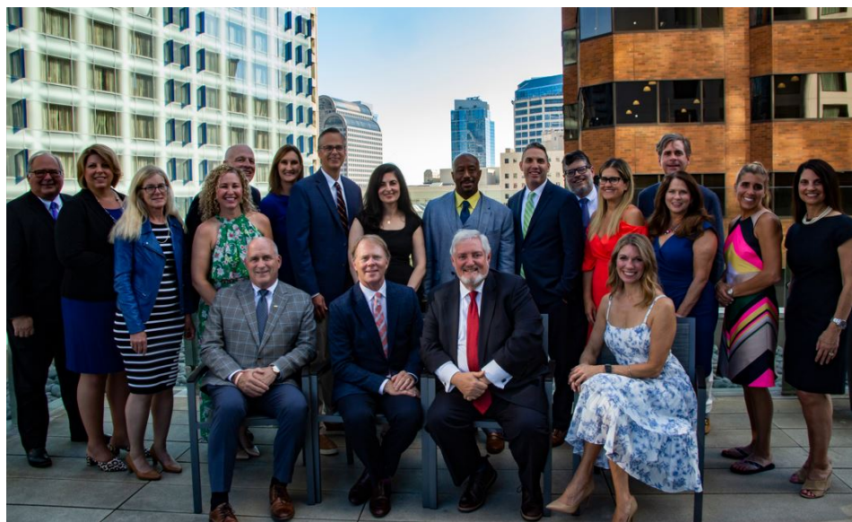
FDCC's 2022-2023 Board of Directors