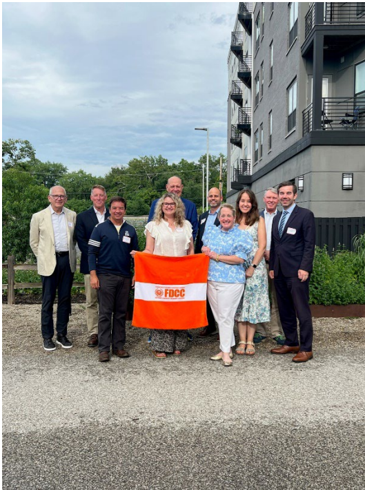
FDCC Indiana Members